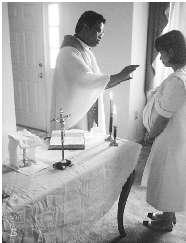
A priest blesses two souls – mother and baby

F ROM THE BEGINNING OF TIME, God created both spiritual and material creatures. Only one, humankind, is a spiritual-material creature. This means that, when creating a human person, God combines spirit and matter to form a single being who is free to know and love. To un-