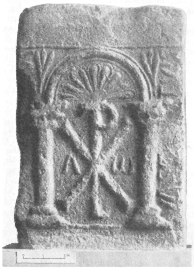
Chi-Rho symbol, formed from the first two letters from the word 'Christ' in the Greek language, 4th century Spanish tombstone

3 Jn 3 John Jon Jonah Joshua Jos Jude Jude 1 Kgs 1 Kings 2 Kgs 2 Kings Lam Lamentations Luke Lk L_{V} Leviticus Mal Malachi 1 Maccabees 1 Mc 2 \, \mathrm{Mc} 2 Maccabees Mi Micah Mark Mk Matthew Mt Na Nahum Neh Nehemiah Numbers Nm Obadiah Ob Phil Philippians Philemon Phlm Prv Proverbs Psalms Ps(s)1 Pt 1 Peter 2 Pt 2 Peter Romans Rom Ru Ruth Rv Revelation Sirach Sir 1 Sm 1 Samuel 2 Sm2 Samuel Song of Songs Song Tobit Tb 1 Thes 1 Thessalonians 2 Thessalonians 2 Thes Ti Titus 1 Tm 1 Timothy 2 Tm2 Timothy Wis Wisdom Zec Zechariah