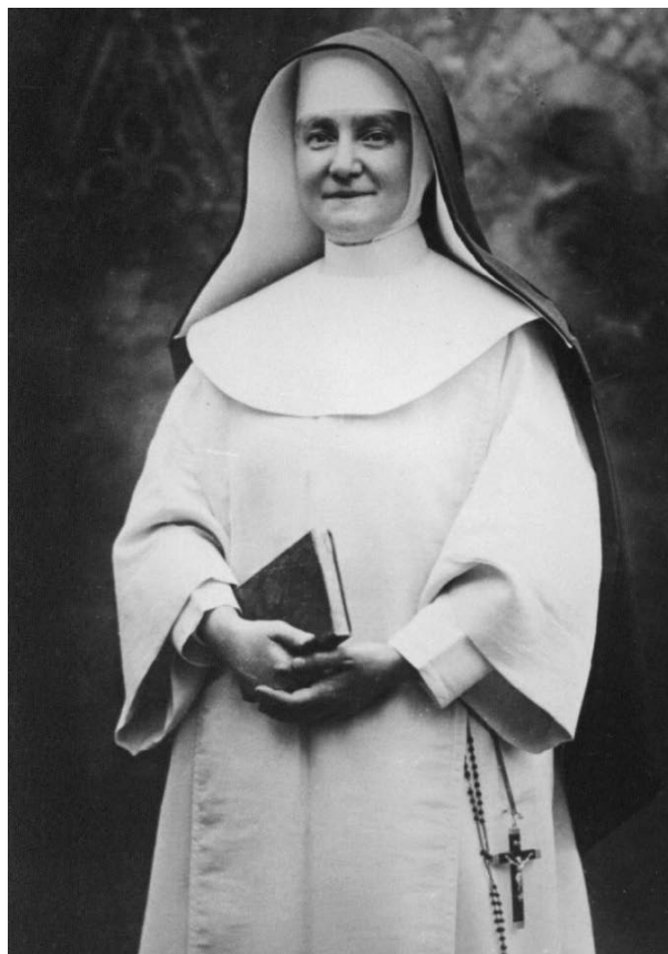
A 1910 photograph of a sister of the Dominican Order (Order of Preachers) (OP), founded by St. Dominic in the early 13th century

The Liturgy of the Hours (sometimes called the Divine Office) is an integral part of the public prayer of the whole Church. It consists of a four-week cycle of singing Psalms, reading Scripture, and interceding for the needs of the whole Church. The Church gathers at various hours during the day to pray the liturgy. At